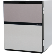
OR RUBY 530