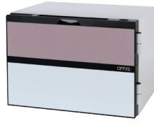
OR RUBY 310