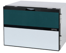
OR EMERALD 310