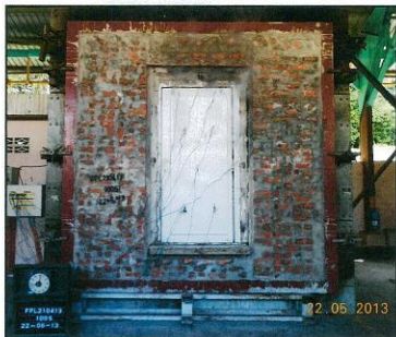
Plate 2. During the test. (Time : 17 min)