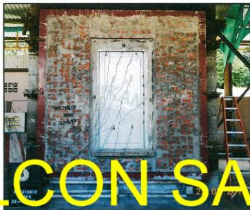
Plate 1. Before the test

This report is NOT A QUALITY ASSURANCE CERTIFICATE NOR AN APPROVAL PERMIT . The report refers only to samples submitted by client to FRIM and tested by FRIM . The FIRE PROTECTION LABORATORY is not responsible in selection of samples for testing. This report only be reproduced in full. Extracts or abridgements of report shall not be published by any means or forms without written approval from the "DIRECTOR GENERAL FRIM".